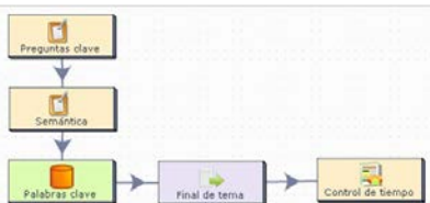
Fig. 2 Key question microsequence: different activities that constitute the sequence