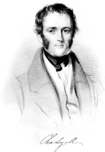
FIGURE 1 | Charles Lyell around 1836. Drawing by J.M. Wright. National Portrait Gallery, London, (Wilson 1972).

The major aim of Lyell's trips to Spain was the study of volcanic systems, although he also made other interest-